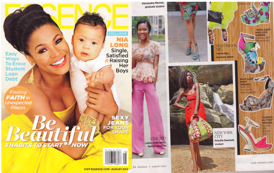
ESSENCE MAGAZINE AUGUST 2012 ISSUE